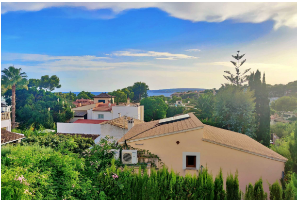
View (roof terrace)