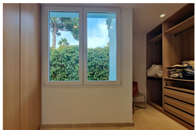
Dressing room (Master)