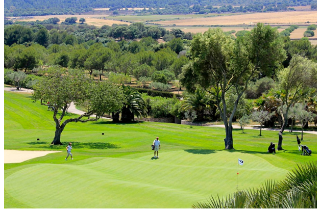
Golf Course (Surrounding)