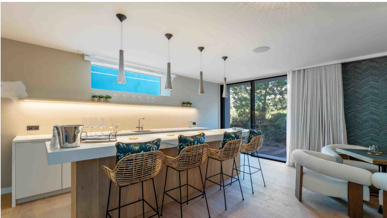
2nd Living room with bar area