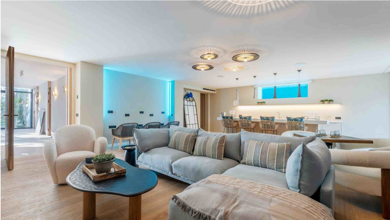
2nd Living room with bar area