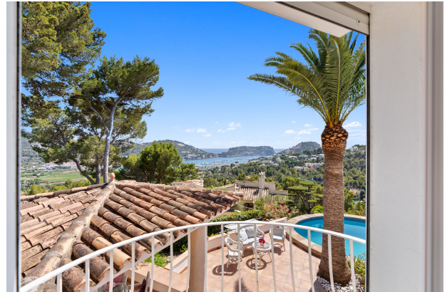
View (Bedroom 1)