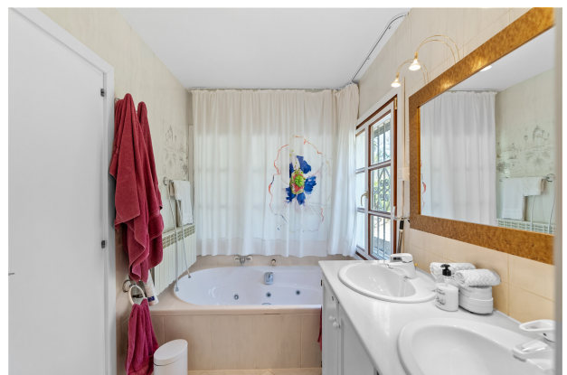
Bath en Suite (Bedroom 1)