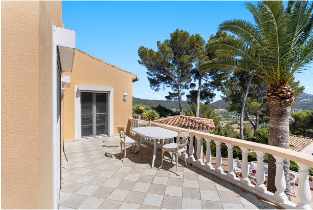
Terrace (Upper floor)