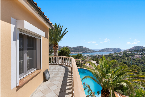
Terrace (Upper floor)