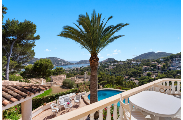
View (Upper floor)