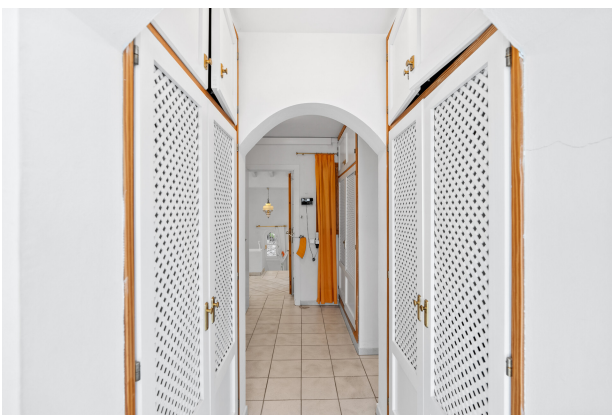
Dressing area (Bedroom 1)