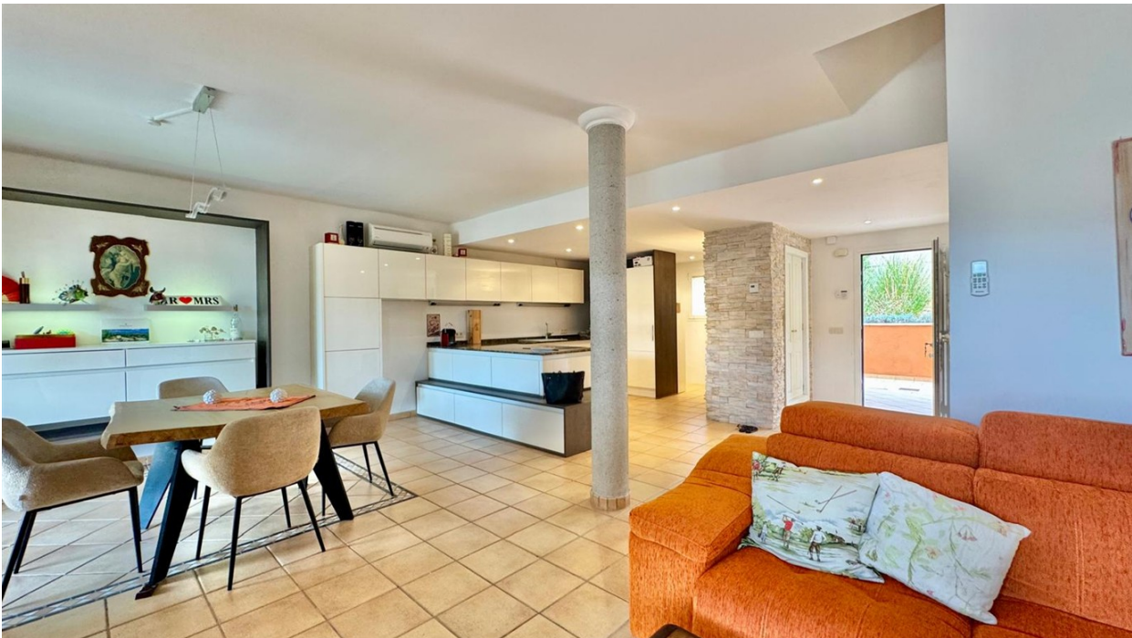
Living / Dining