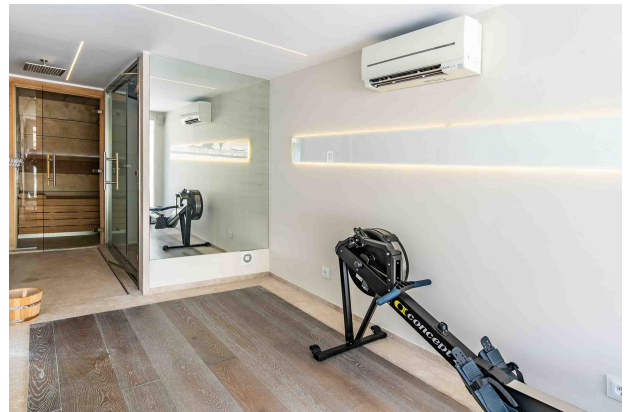
Gym / Sauna