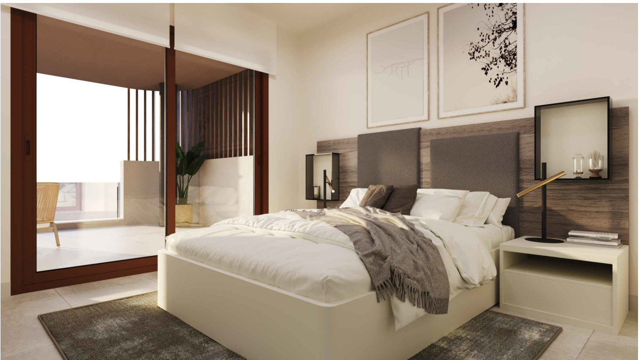
Schlafzimmer 1 (Rendering)