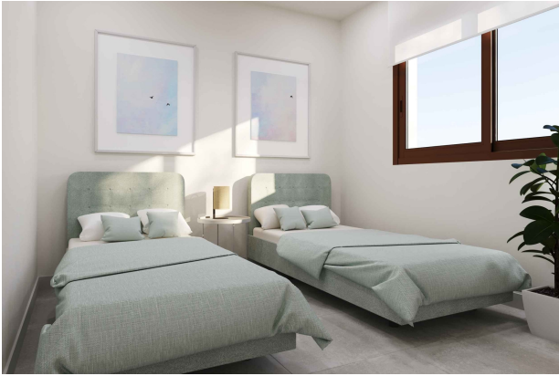
Schlafzimmer 2 (Rendering)