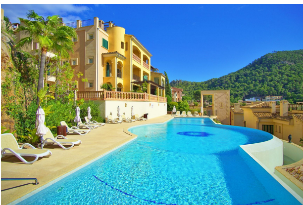
Swimmingpool 2 (Community)