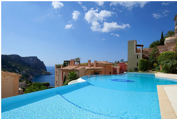
Swimmingpool 2 (Community)