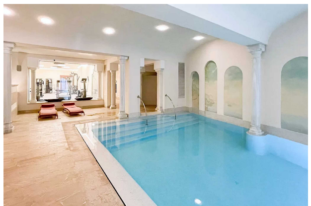
SPA Area Swimmingpool (Community)