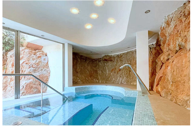
SPA Area Jacuzzi (Community)