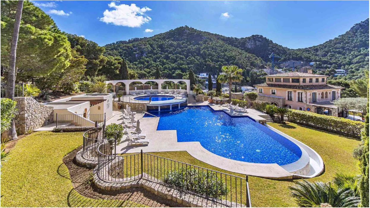
Swimmingpool 1 (Community)